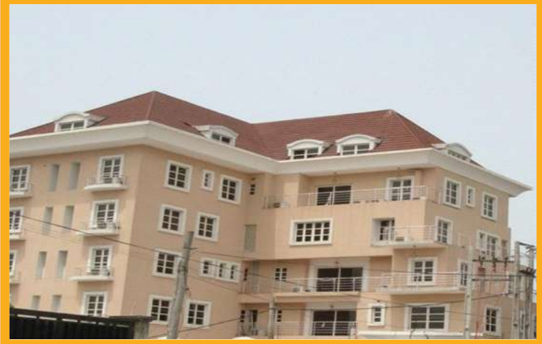
AMAZING GRACE FLATS, IKOYI