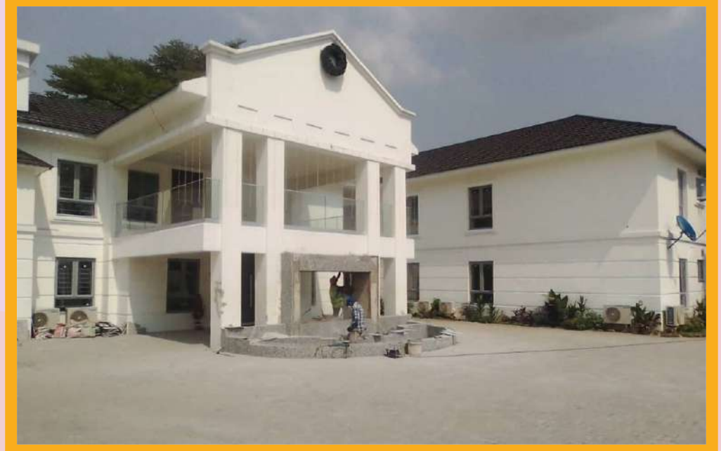
Residential Development in Ikoyi for Senator Omisore