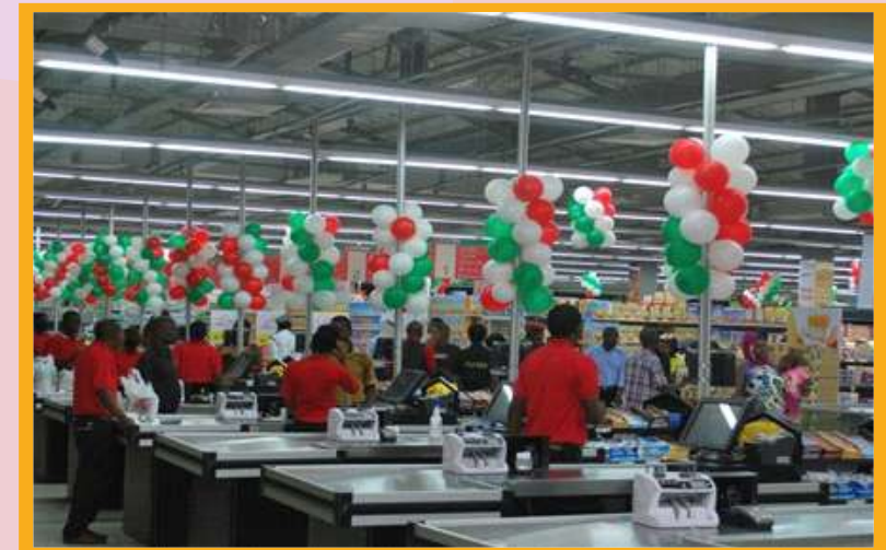
ILUPEJU MALL, TOWN PLANNING WAY