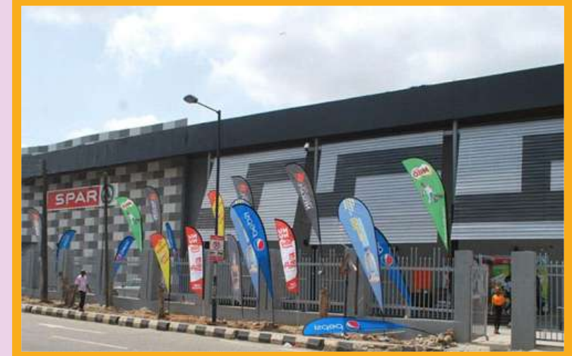
ILUPEJU MALL, TOWN PLANNING WAY