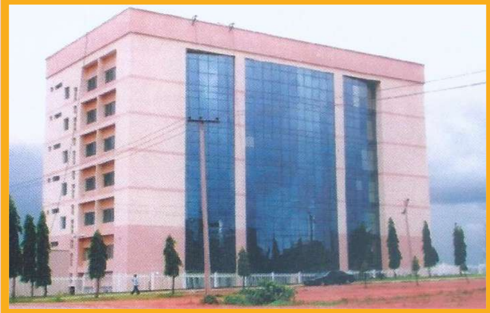
Head Office Building for Elizade Nig. Ltd. at Plot 596, Cadastral Zone, CBD, Abuja