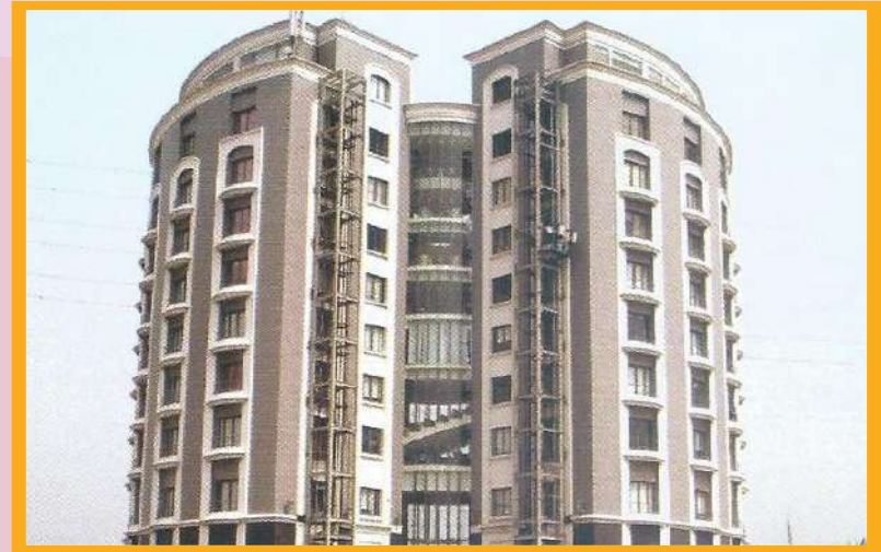
Office Block Development on Banana Island (Abugansoro) Ikoyi, Lagos.