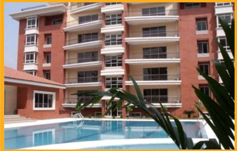
RESIDENTIAL DEVELOPMENT ON 20, TEMPLE RD, IKOYI