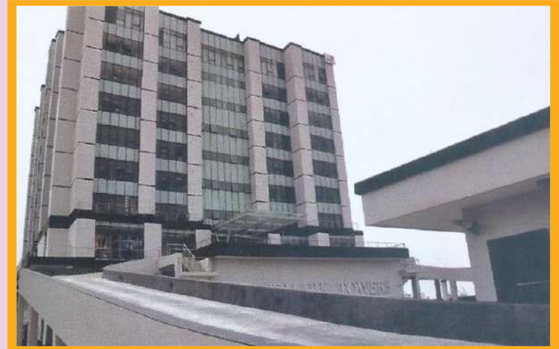
Landmark Towers at Water Corporation Drive, Oniru, Victoria Island Extension, Lagos.